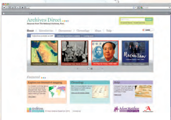
The Camel Corps at Palmyra; President Hashem Atassi. Back: Aleppo Street; Jerusalem in the 1870s.

Confidential Print: Middle East is an Archives Direct resource enabling users to benefit from searches across all projects within the Archives Direct Portal. All document images are provided in full-colour high resolution and are full-text searchable. Please see our website for more details.